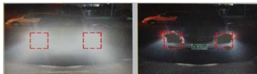
HS BLC OFF